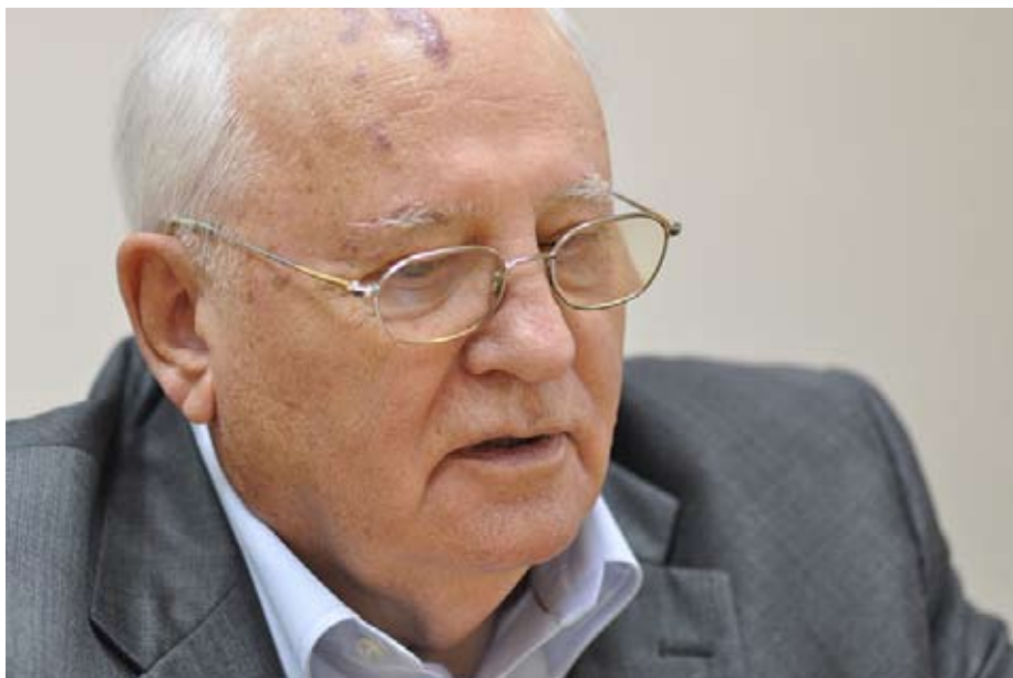
Mikhail Gorbachev, one of many famous guests to have been welcomed by the Radisson Blu Hotel, Bucharest