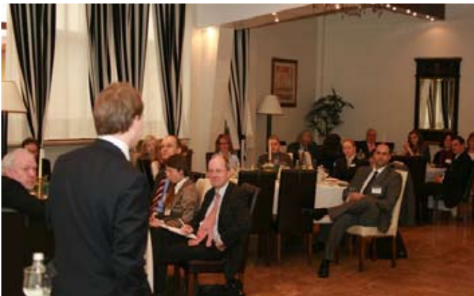
Guests at the Business Breakfast with the British Ambassador