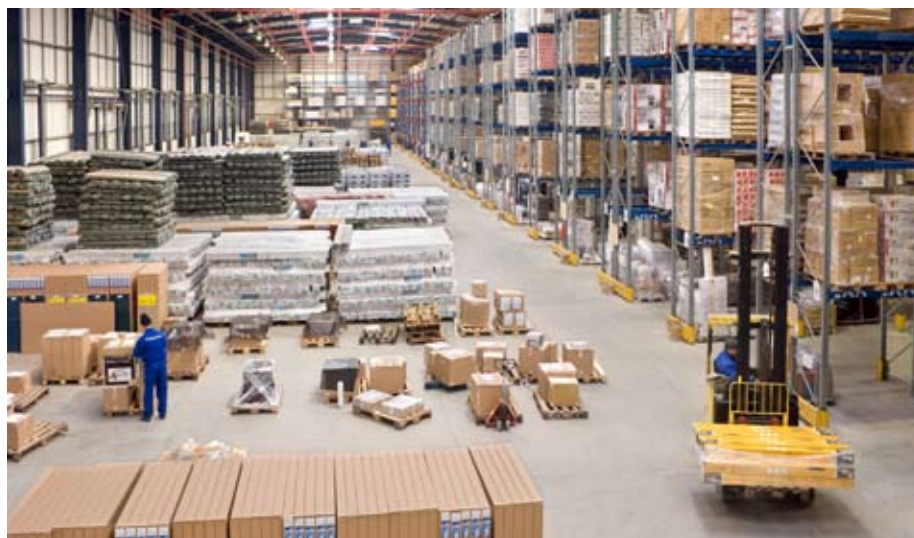
Tibbett Logistics warehousing operations in Bucharest

intercontinental logistics service provider Tibbett & Britten Group plc for 20 years. With their former colleagues, the current Keswick Board grew Tibbett & Britten Group's revenues from £30 m to £2.3 bn in just two decades. Keswick is now bringing this international know-how and experience to bear on Tibbett