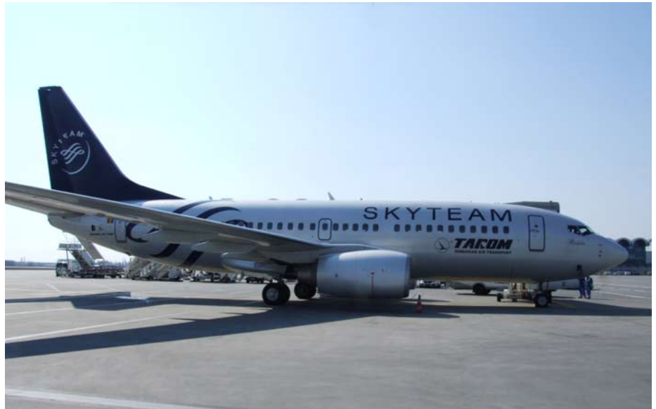
The Boeing 737-700, known as 'Bralia', in the new SkyTeam livery

The first flight with the new livery comes ten years after the first commercial flight of the aircraft YR-BGF known as 'Braila'. This aircraft has a capacity of 116 seats (14 seats in Business Class and 102 seats