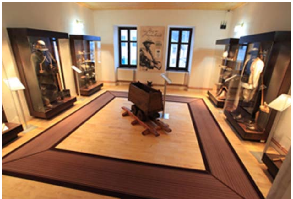
RMGC has restored a building in the Roşia Montană Historic Centre, housing the mining history exhibition 'Gold of Apuseni'